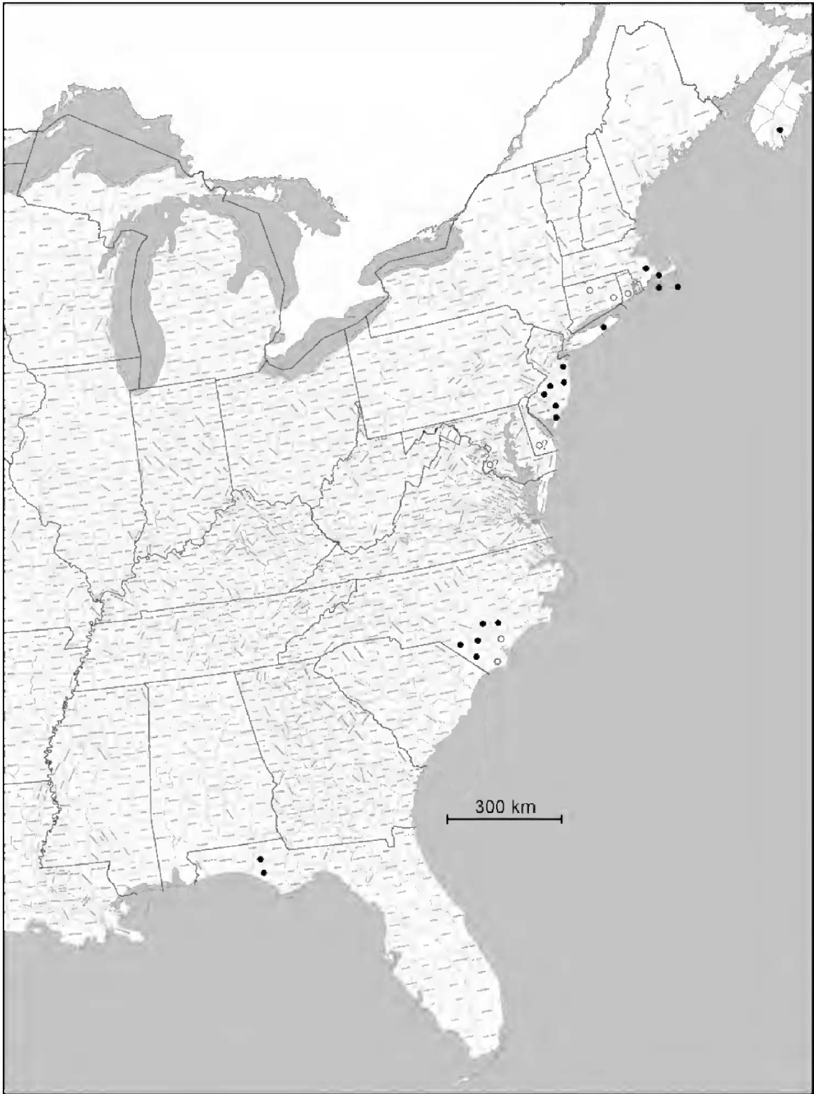
Figure 2: A 2010 snapshot of the range of Drosera filiformis . Counties believed to currently maintain native populations are indicated by a black dot. Counties where it is believed D. filiformis has been extirpated are indicated by an empty circle. Only native sites have been plotted. The question marks for the Delaware and Maryland sites note that it has not been confirmed that Drosera filiformis has ever occurred as a native at these locations.